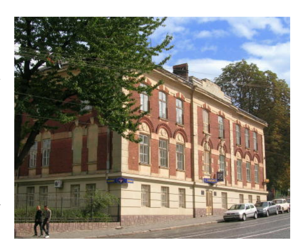
Figure 3. This is a sample of a bitmap image. This cosy building homes the Institute for Condensed Matter Physics and the CMP Editorial Office too.

Roughly speaking, there are two types of electronic figures: vector graphics and bitmap graphics. A vector image is a set of arranged objects: lines, polygons, ellipses, shades, characters, etc. Such an image allows almost arbitrary scaling without loss of quality. Vector images are typically charts, plots, diagrams, etc., produced by various computer software. A bitmap image is a two-dimensional array of pixels (PICture'S ELements) or "dots". Continuous tone photographs are their the most widespread samples (like figure 3). Image quality is determined by DPI (Dot Per Inch — a pretty self-explained definition). Below, there are necessary requirements for each type of images.